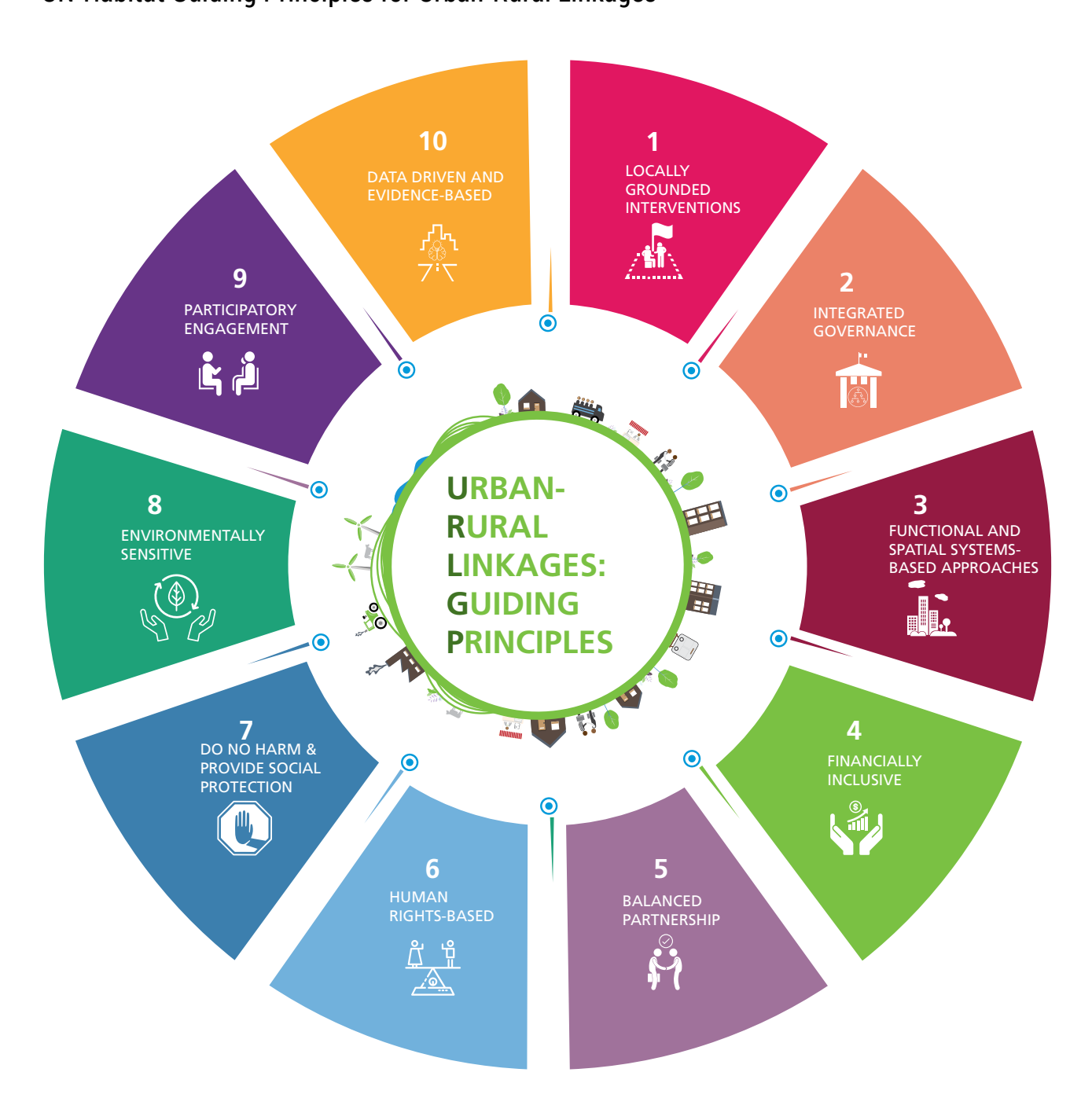
Figure 1. UN-Habitat Guiding Principles for Urban-Rural Linkages