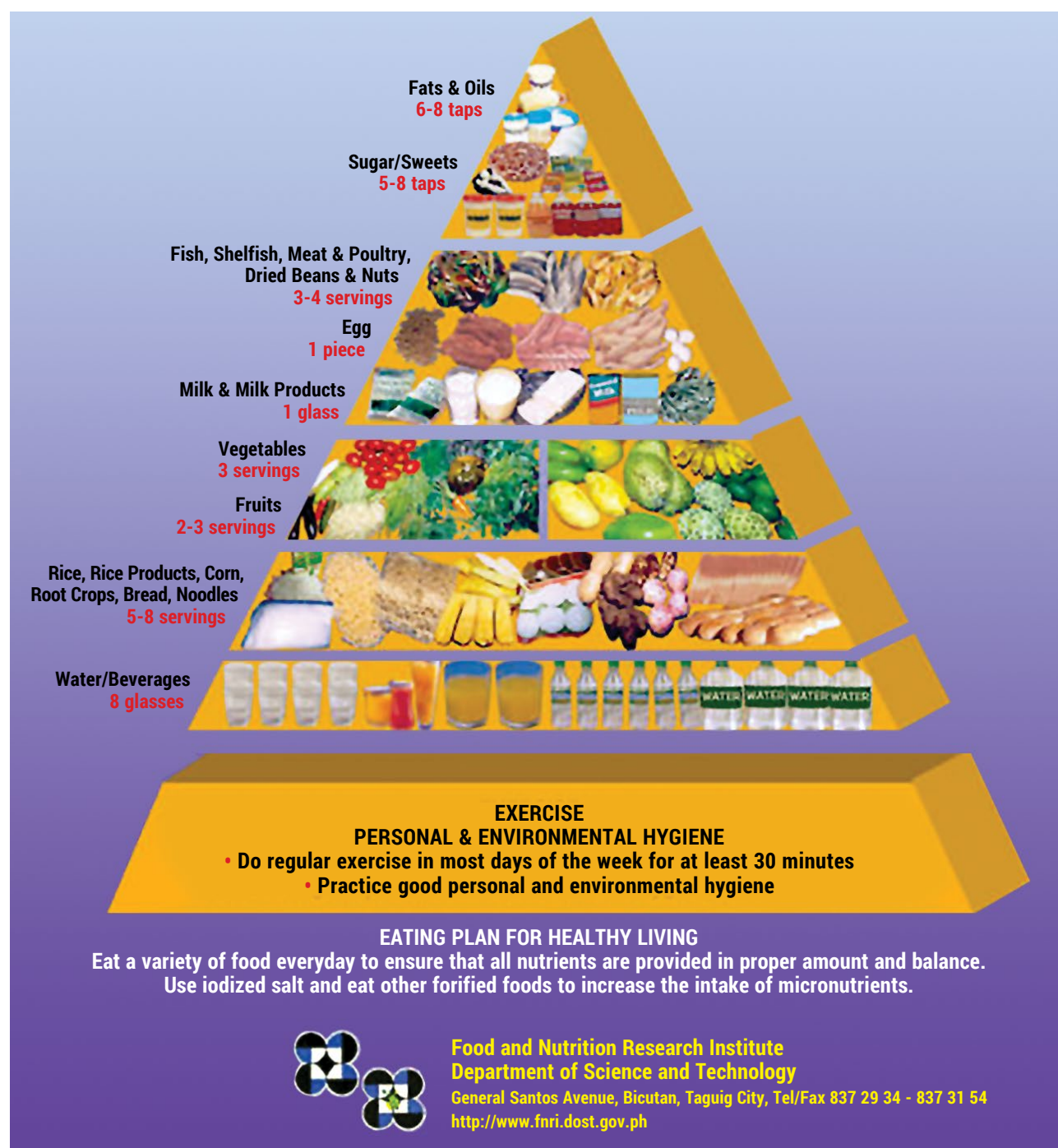
Figure 1. Philippines FBDG

Across all of the FBDG reviewed, graphic representations typically included a whole fish. Specific fish species were more commonly depicted in graphic representations by region, such as salmon in North America and Europe, and pelagic small fish species in sub-Saharan Africa, South and Southeast Asia. The FBDG of Thailand and Sri Lanka illustrated the greatest variety of aquatic foods in graphic form, perhaps, due to the great diversity of aquatic foods common in diets and production systems in these countries. However, Japan's FBDG pictured just one aquatic food, even though the Japanese diet is well-known for its diversity of aquatic foods.